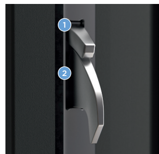
Sealing element (1) activated, hook (2) extends and engages deeply in the keep rail.

Aug. Winkhaus SE · August-Winkhaus-Straße 31 · 48291 Telgte · Germany Contact: 49 3693 950-0 · tuerverriegelung@winkhaus.de Winkhaus UK Ltd. · 2950 Kettering Parkway · NN15 6XZ Kettering · Great Britain Contact: T +44 1536 316 000 · enquiries@winkhaus.co.uk